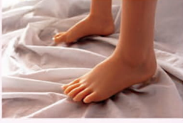
Foot completely on the ground--correct