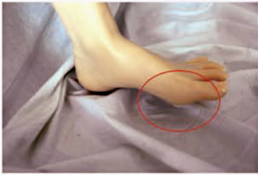
Tilted fore foot--wrong